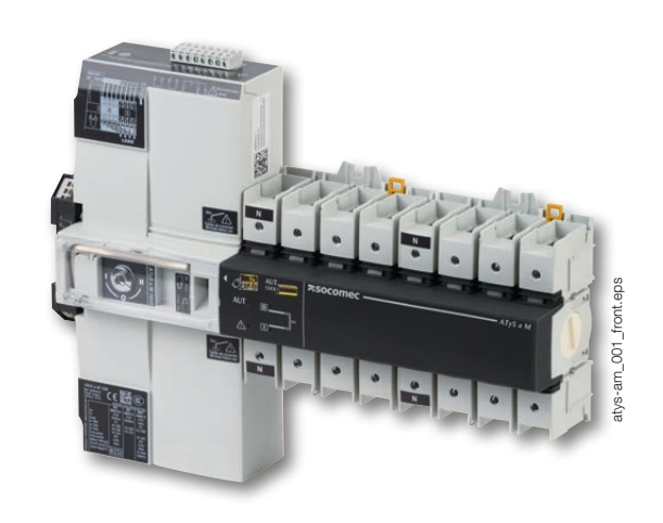
ATyS a M